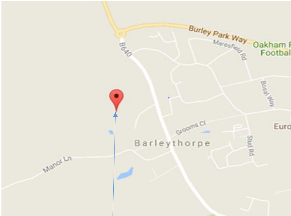
Oakham United Football Club

Further details on Oakham United FC website at: http://www.oakhamunited.co.uk/page5.html